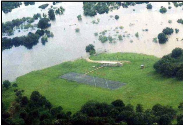
These two photos were taken by Buster Hinkle a few days earlier on July 12 th . The lake level is a foot lower in these pictures.