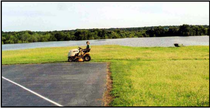
The above photos were taken the same day as the cover photo. Buster and Derek Hinkle paddled a small boat out to the flying field to check it out. They decided to do a little mowing while there!