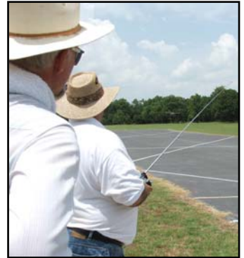
Some serious (and not-serious) flying was witnessed