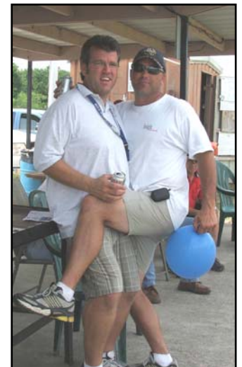
"Don't ask... Don't tell?"