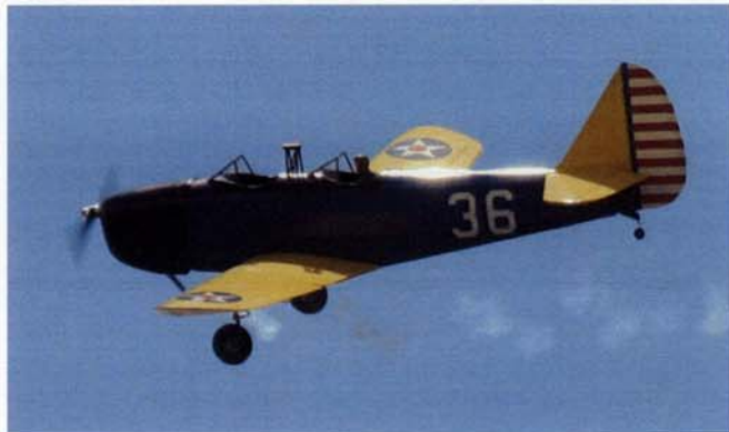
Monoplanes - 80" wingspan or larger