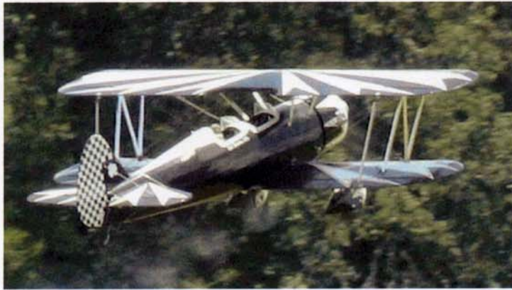
Biplanes - 60" wingspan or larger