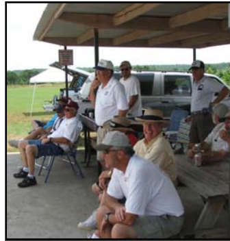
The Peanut Gallery