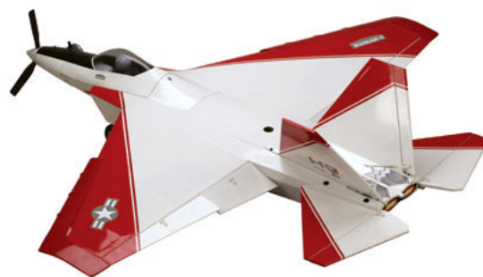
This year's raffle plane!