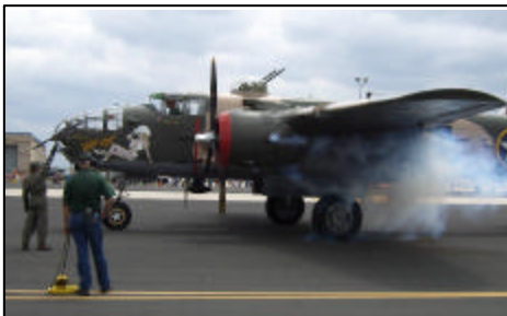
The B-25, Yellow Rose, cranking the left engine.