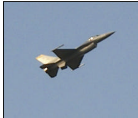
An F-16 fighter demonstrates high alpha slow flight