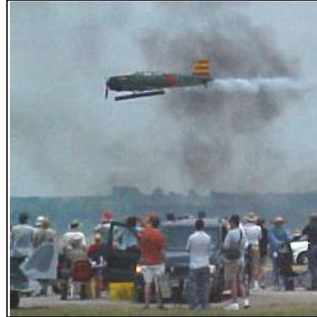
A Japanese torpedo bomber makes a pass during the Tora! Tora! Tora! routine.