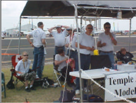
Our booth and several members Saturday afternoon.