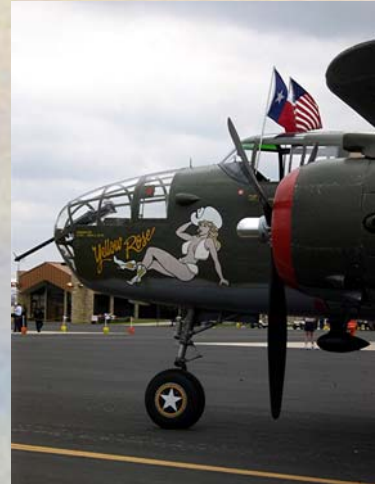
Love the nose art!