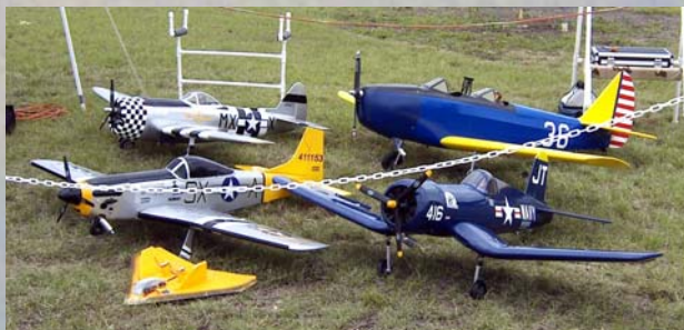
We supplied our own WWII Army Air Corps on Sunday!