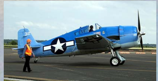
First time in Temple, believe it is a Hellcat!