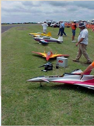
Flight line for the R/C Demo