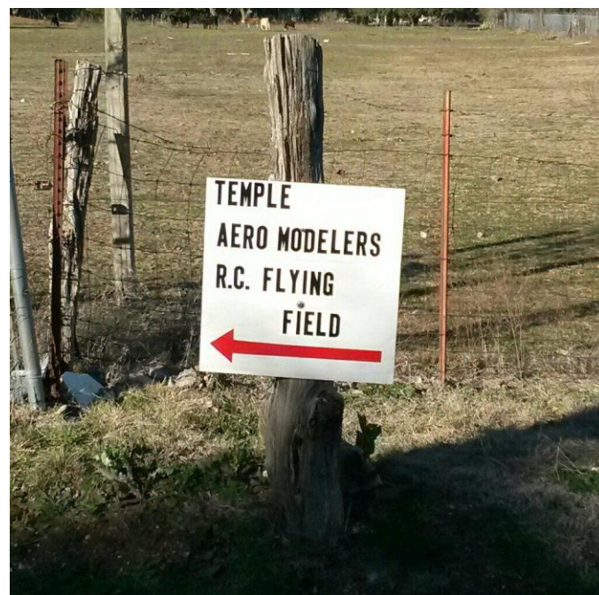
Brady Sherwood recently replaced the old tattered sign that is located at the “tee” intersection of Moffat and Water Supply Roads and points to our field. Thanks, Brady!!!