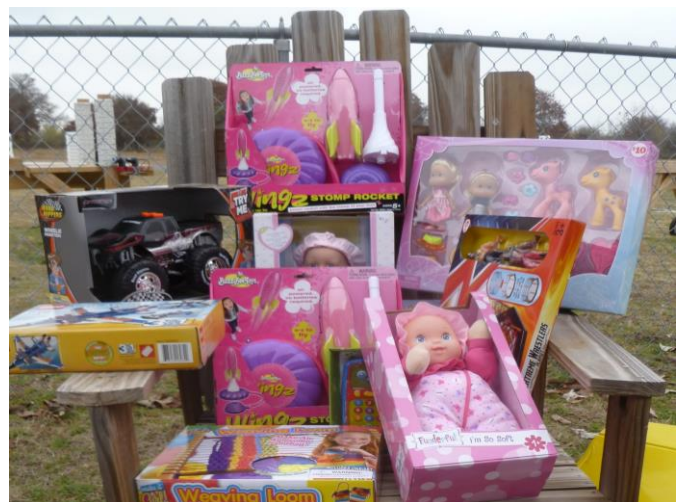
Here are some of the nice toys collected at our Toy Fly.