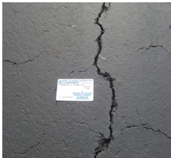
Here's one of the worst cracks still remaining after the seal coating, at the center of the runway.