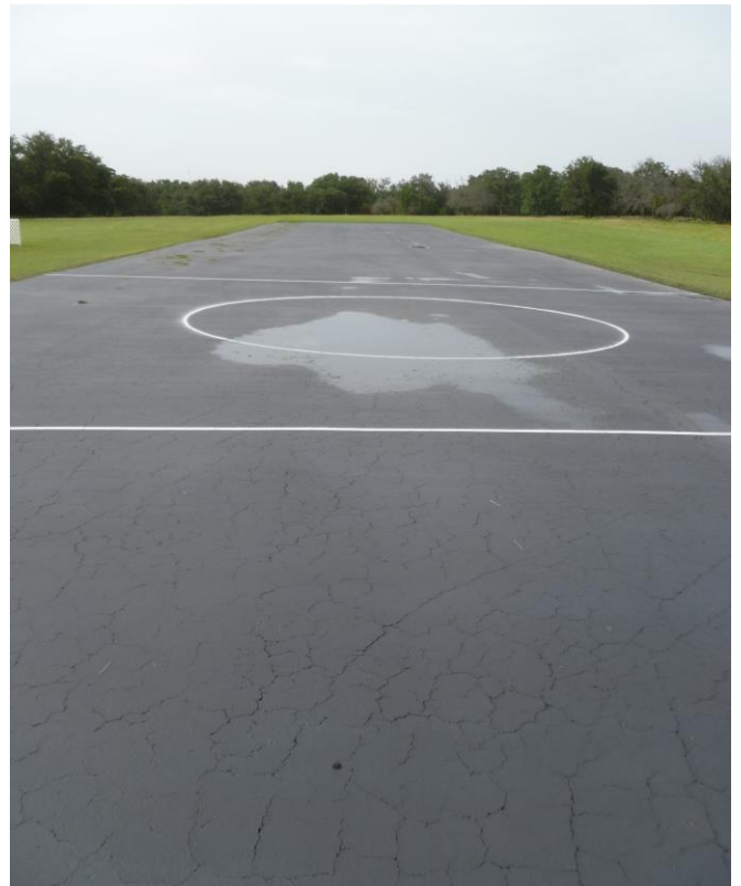
The runway has now been seal-coated and restriped!

Lake Belton has risen almost 28 feet since early May, but has now peaked and started falling since the dam gates are now open. That's until we get some more heavy rains anyway! (FYI, the curve in the gravel road leading to our field goes underwater at 617' elevation)