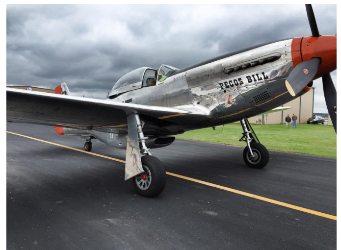
This really nice P-51 Mustang "Pecos Bill" flew in for the Lone Star Flight Club's Aviation Day.