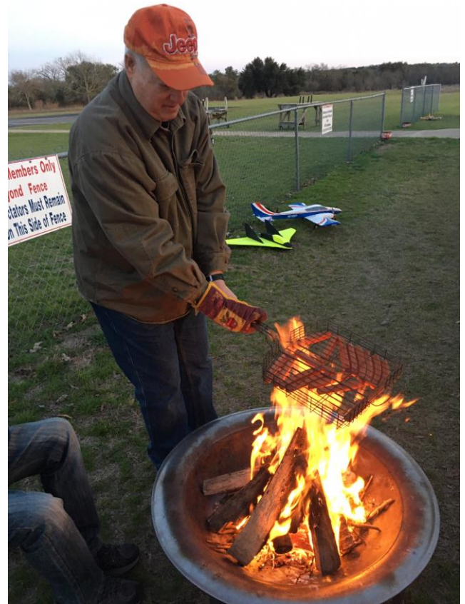
Here's our Club President cooking up a batch of hot dog wieners at the last Night Fly event.