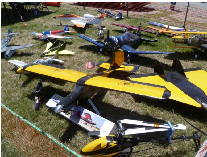
The club had a really nice static display at the airshow this year!