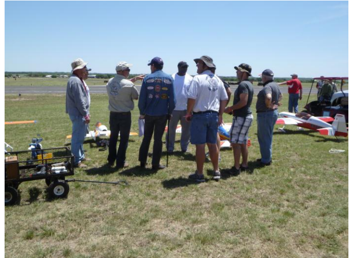
Here's the Saturday demonstration flight team and helpers preparing for the start of the show.