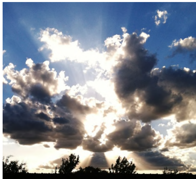
Nice Sunset on a Wednesday evening of flying!