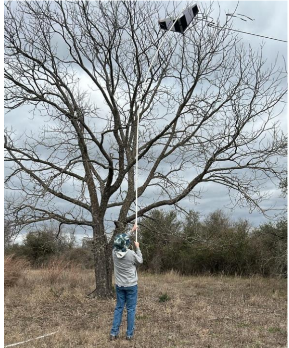
One of our field's plane-eating trees jumped out and grabbed Chris's combat plane and appeared to get a streamer cut!