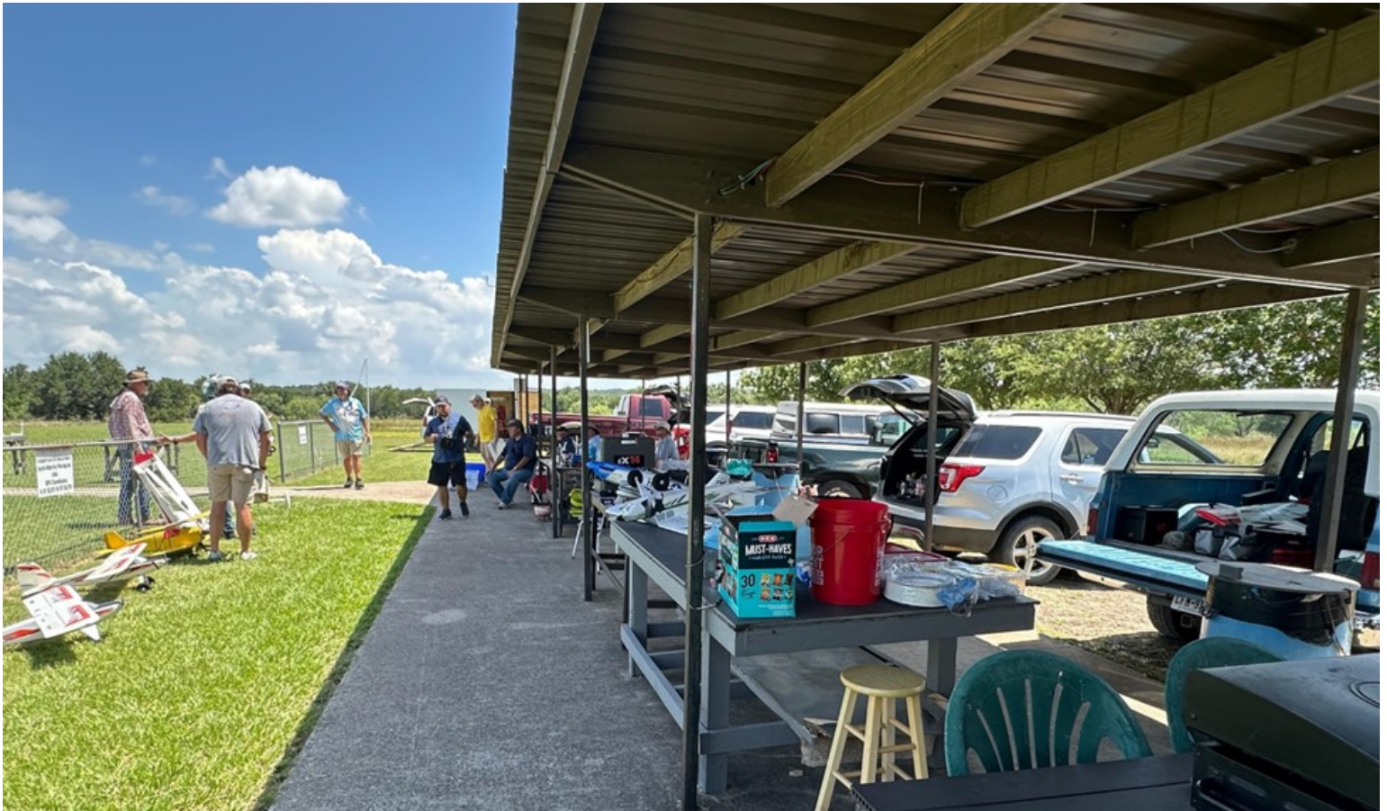
A view of the field during the Sanctioned Fun Fly.

See you next time, on June 28 th for our next Combat contest.